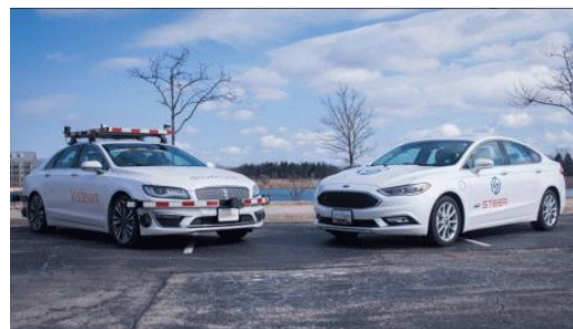
MDOT MARYLAND DEPARTMENT OF TRANSPORTATION MOTOR VEHICLE ADMINISTRATION