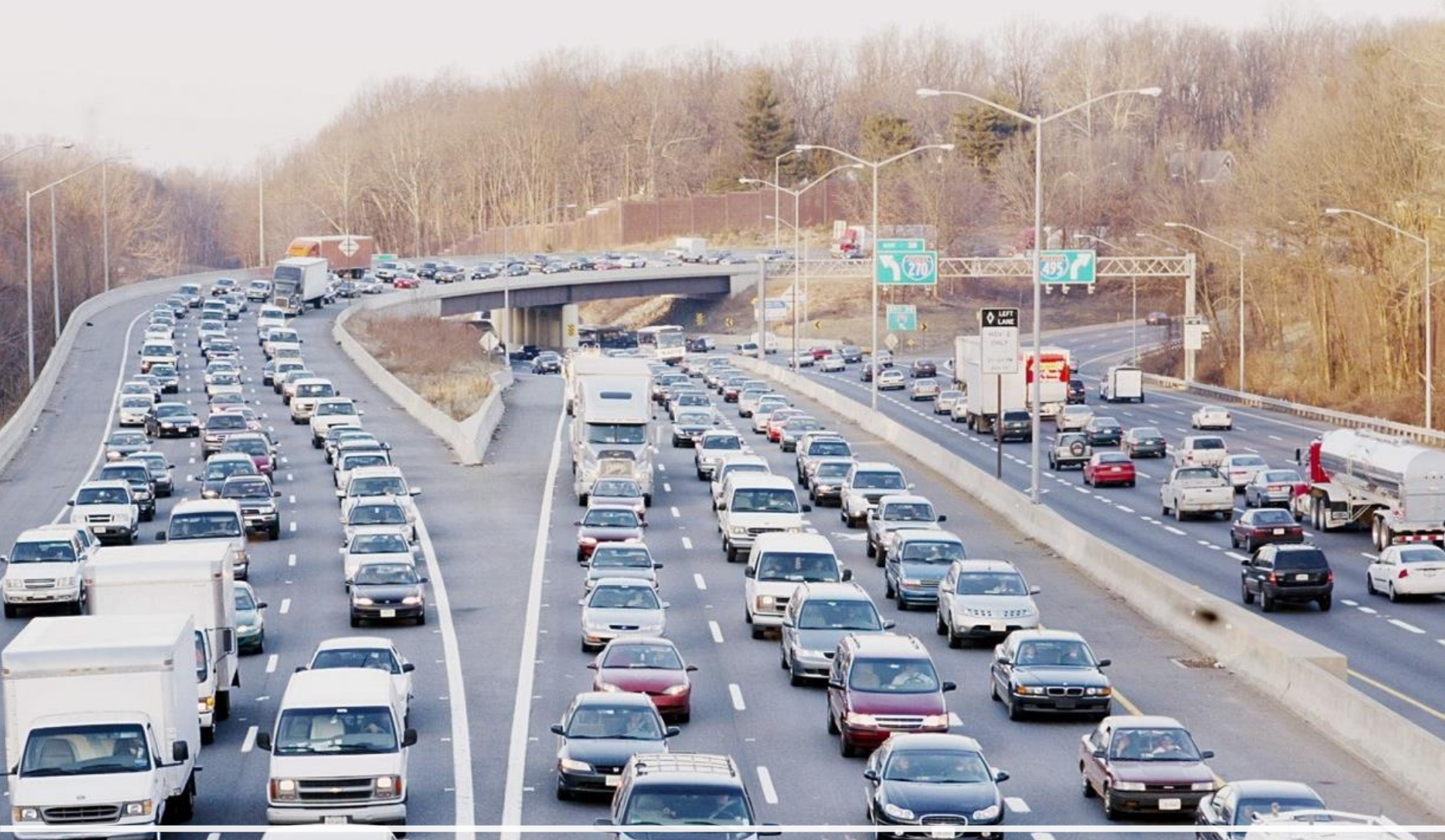
Interstate 495/Interstate 270 Interchange