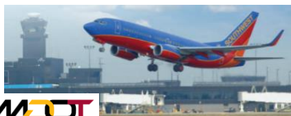
MDOT MARYLAND DEPARTMENT OF TRANSPORTATION MARYLAND AVIATION ADMINISTRATION