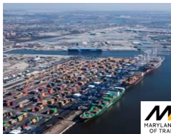
MDOT MARYLAND DEPARTMENT OF TRANSPORTATION MARYLAND PORT ADMINISTRATION