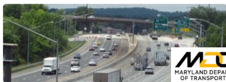
MDOT MARYLAND DEPARTMENT OF TRANSPORTATION STATE HIGHWAY ADMINISTRATION