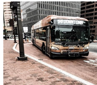
MDOT MARYLAND DEPARTMENT OF TRANSPORTATION MARYLAND TRANSIT ADMINISTRATION