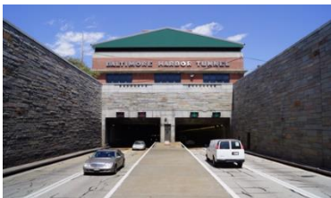
MDOT MARYLAND DEPARTMENT OF TRANSPORTATION MARYLAND TRANSPORTATION AUTHORITY